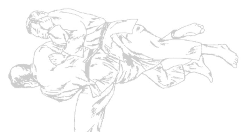
Women's Committee Senior Camp 05/06